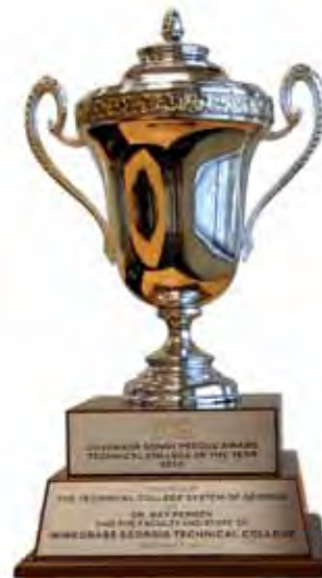
Governor Sonny Perdue Award Technical College of the Year 2010