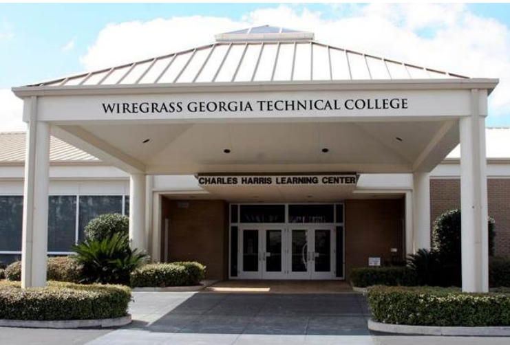
Ben Hill-Irwin Campus

Wiregrass Georgia Technical College is a unit of the Technical College System of Georgia. Recognized for achievements in workforce development, Wiregrass provides individuals with the education, training, and skills to positively influence our economy. Having several programs ranked as the top in the state or nation validates the quality of education and competence of Wiregrass graduates.