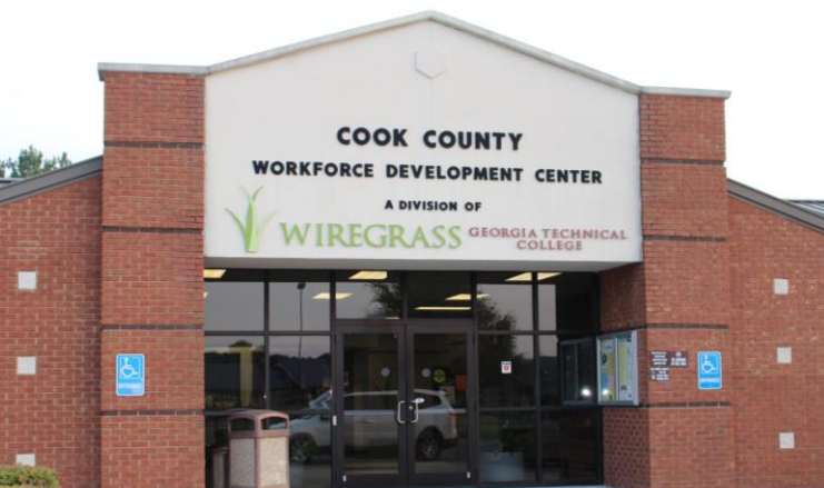
Cook County Workforce Development Center

By combining the academic programs, Adult Education services, and continuing education provided through Economic Development, Wiregrass Georgia Technical College impacts the lives of more than 7,986 students annually.